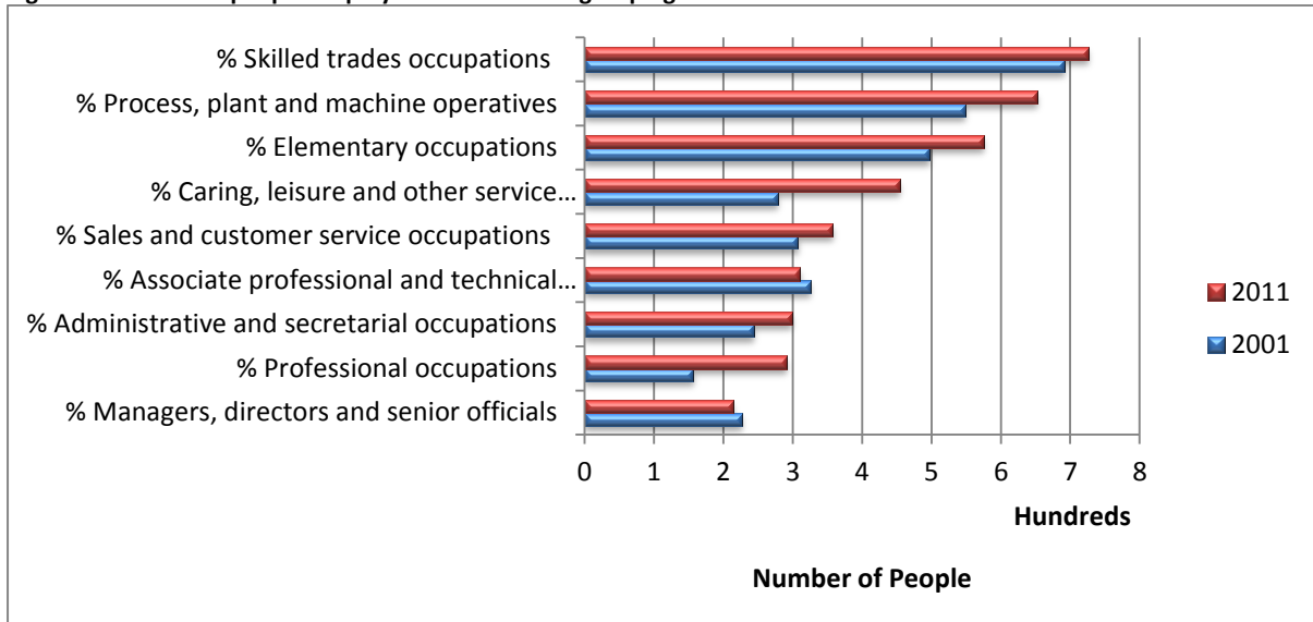
Figure 2: Number of people employed in each of the groupings at the 2001 and 2011 censuses.