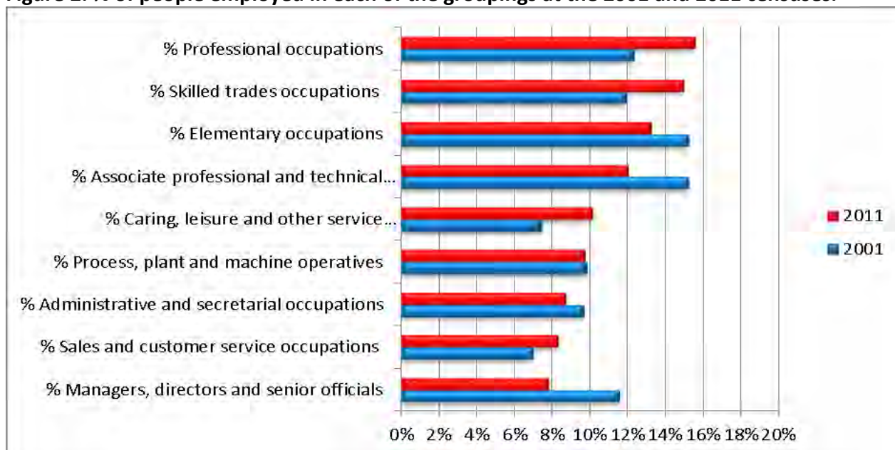
Figure 2: % of people employed in each of the groupings at the 2001 and 2011 censuses.